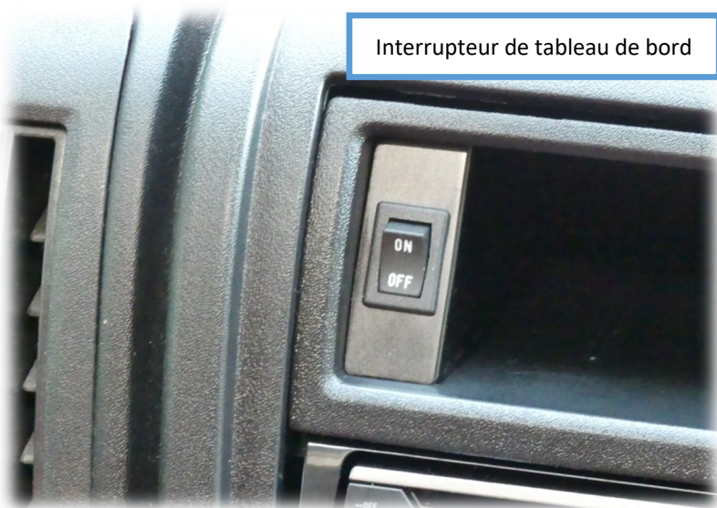
Interrupteur de tableau de bord